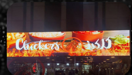
Cluckers Al Hassa