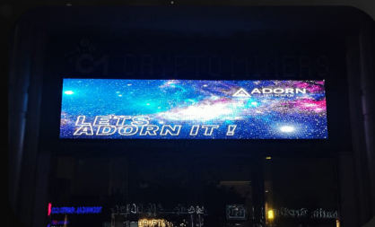
Crypto Miners, Dubai