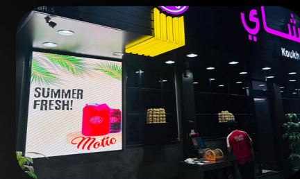
Kokhu Al Shai Cafeteria, Dubai

Pixel : P2.5 Outdoor , Size: 160CMx160CM