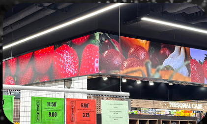
Al Madina Market Muraqqabat