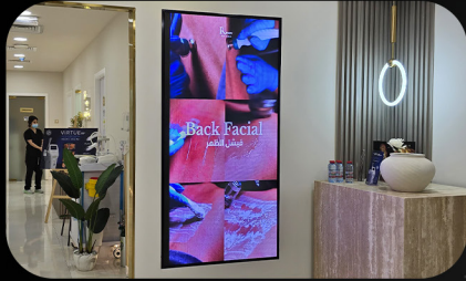
Beauty Clinic Alquoz

WE HAVE 10+ YEARS EXPERIENCE IN THE INDUSTRY TO DELIVER BEST RESULTS FOR YOUR PROJECT.