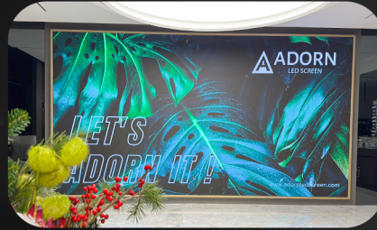
ANNEX, Business Bay, Dubai.