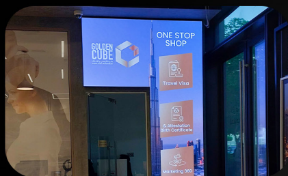
Golden Cube Dubai