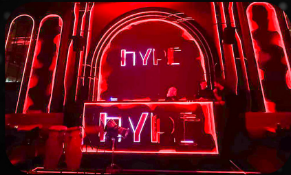
Hype Club DIFC, Dubai