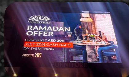
Kit and Kaboodle Al Quoz