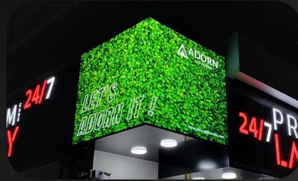
PREMIUM Laundry Al Warqa