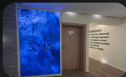
Zoi Clinic Jumairah