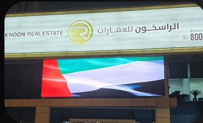
AL Rasikhoon Ajman