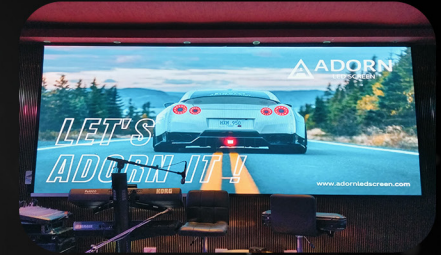
Al Hannes Cafe, Ajman