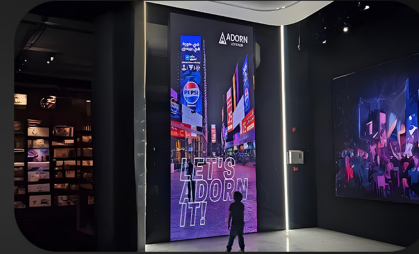
Car Showroom Rasalkhor