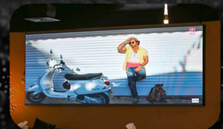
Vegetarian Restaurant, Al Karama, Dubai