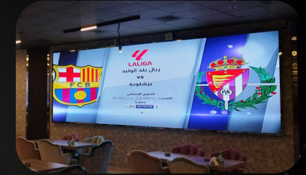
Aldimashaki Al Aseel Ajman