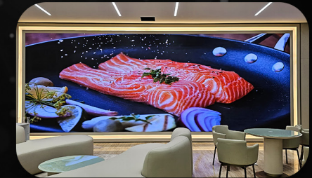
Amis Al quoz