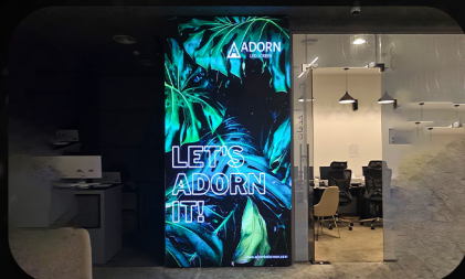
Ontime Business Setup Dubai

Pixel : P2.5 Outdoor , Size: 160CMx160CM