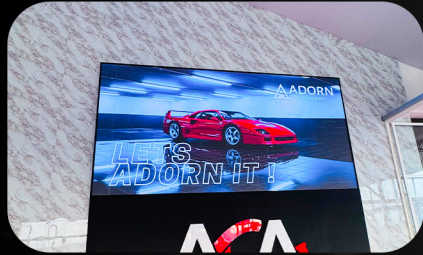
AL Qaryah Cars Auctions. Sajja, Sharjah.

We have been working so hard to deliver customized solutions to our clients. We are very happy that, we could do it all in the time frame. We have been completed nearly 120+ Projects within an year in UAE. Sharing few of our projects with you for the reference.