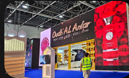
Oud Al Anfar DWTC