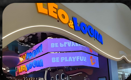
Leo Loona Abudhabi