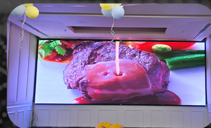
Sevaseas Banquet Hall, Al Nahda, Dubai.