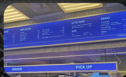
Chicken Man Sharjah