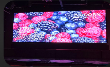
Sevaseas Hotel, Al Nahda, Dubai.