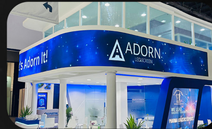
City Pharma, Dubai