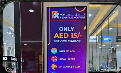
Fedral Exchange Muwaileh