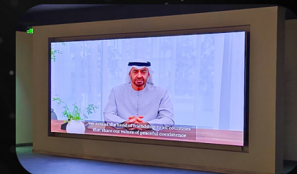
National Library & Archives Sheikh Zayed Festival City