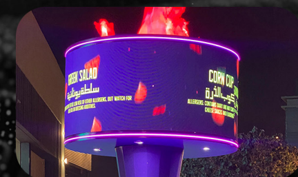
Flaming Hot Riyadh