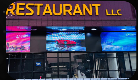
Boat Sea Food Restaurant, Al Warqa, Dubai