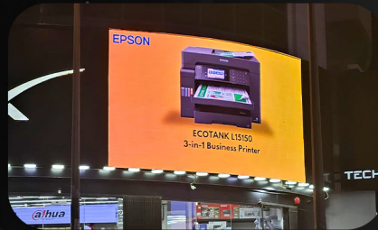
Technox, Burdubai, Dubai.