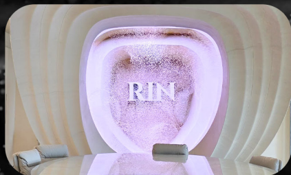
Rin Foundation DIFC, Dubai.