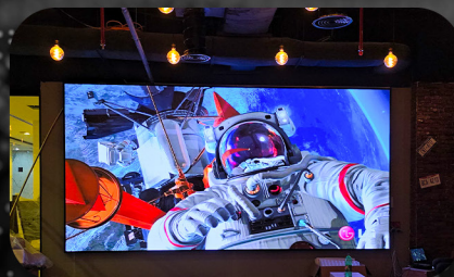
Jefry Sports Bar Al Nahda, Dubai.